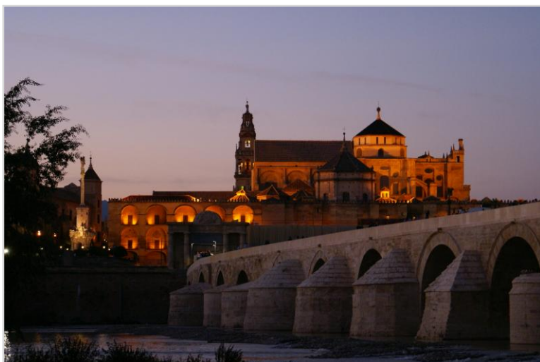
Córdoba: UNESCO World Heritage Site, cultural melting point

Our centre of cultural and language exchange in Cordoba offers students from other countries Spanish through cultural immersion programmes. In addition we give possibilities to gain professional experience during traineeships in the framework of European Programmes such as Leonardo da Vinci or Erasmus. We teach in an innovative and dynamic way, through culture, theatre, cuisine and folk traditions. Fábrica de Idiomas is a meeting place for students and offers an alternative to spending free time in a multicultural environment.