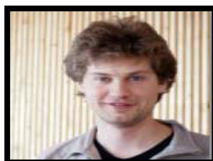
Adrien LASSERRE Architecture