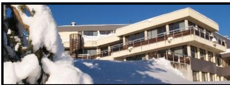
Station de Montagne Prabouré Auvergne- France