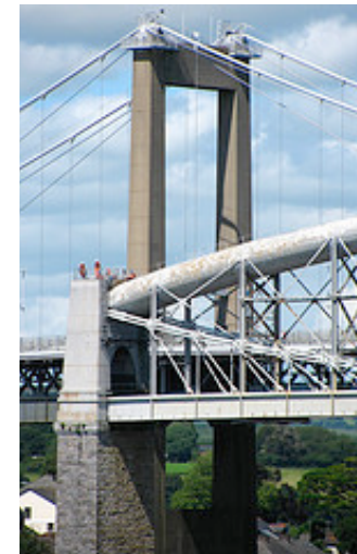
Tamar & Albert Bridge The Gateway from Plymouth to Cornwall.