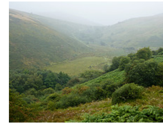
A typical Dartmoor day. Even on a grey day the scenery is stunning