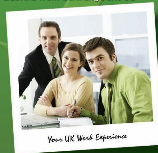
Your UK Work Experience