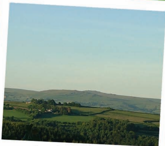
Your UK Work Experience