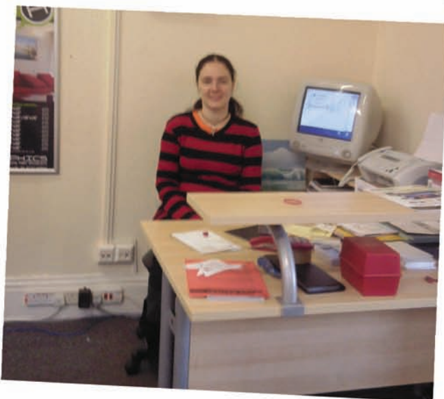
Your UK Work Experience

promoters and co-ordinators from the creation and conclusion of your project tailor-made to suit your requirements.