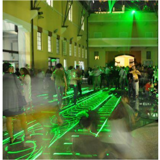
Installation Love Letters by Arthur Duff - Reopening of the MACRO